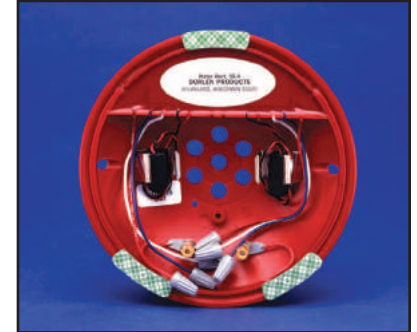
SS-4 Bottom View