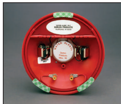
Model SS-2 Bottom View