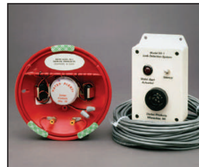
Model SS-1 Bottom View