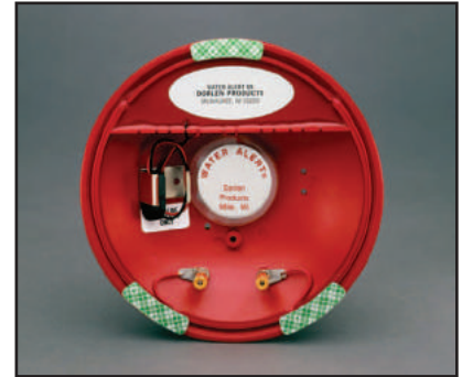
Model SS Bottom View